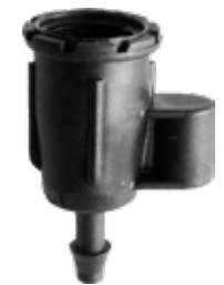
Rod Stake Sprinkler Adapter