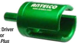
Socket Driver for Rotor Rain™ Plus