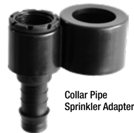
Collar Pipe Sprinkler Adapter