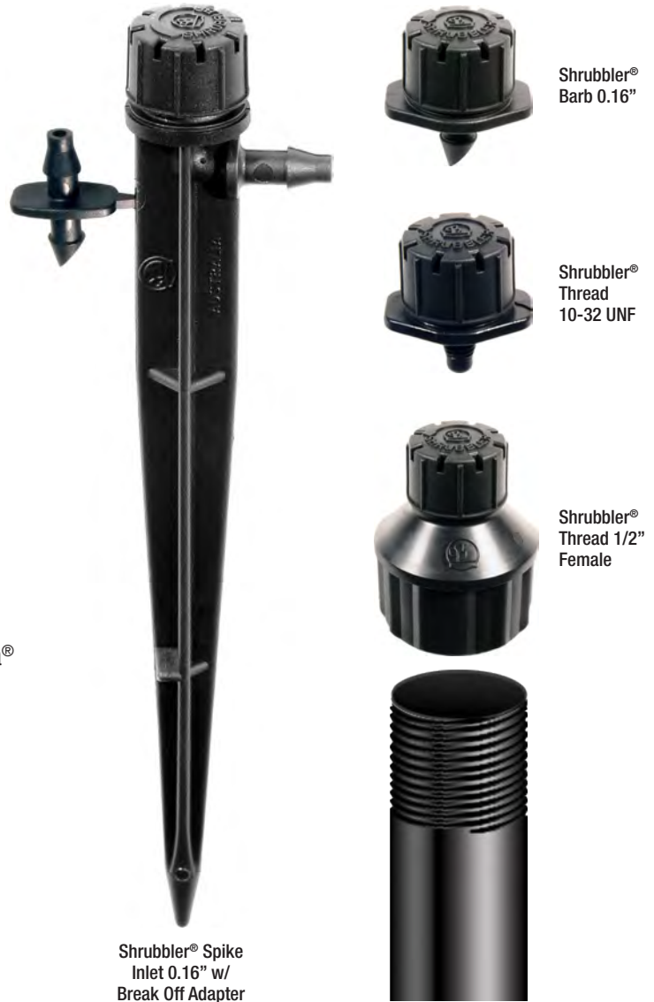
Shrubbler® Spike Inlet 0.16" w/ Break Off Adapter