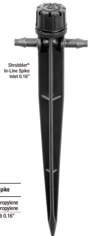
Shrubbler® In-Line Spike Inlet 0.16"