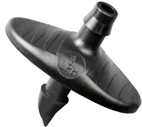
SPEC Drip ™ PC 1 gph