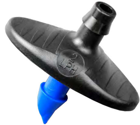
SPEC Drip ™ PC 1/2 gph

Vineyards, orchards, row crops and landscape.