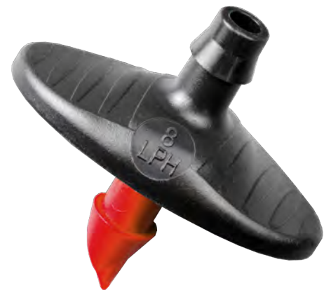
SPEC Drip ™ PC 2 gph