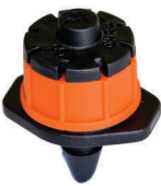
Shrubbler® 360° PC Barb 0.16"