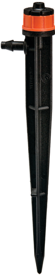
Shrubbler® 360° PC Spike with 0.16" Inlet