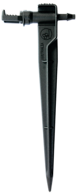
Midi Drip™ Spike with 0.16" inlet