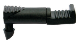
Midi Drip™ Barb 0.16"