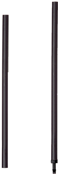
Rigid Riser Plain