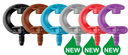
CFd™ Downspray Range