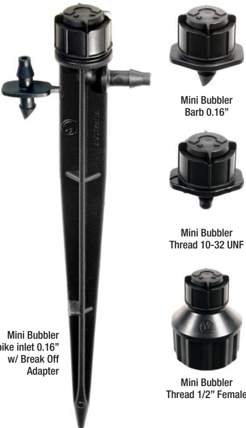
Mini Bubbler Spike inlet 0.16" w/ Break Off Adapter