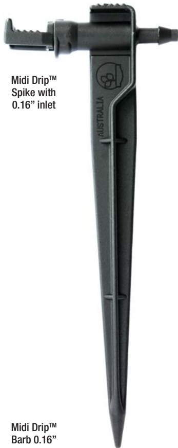
Midi Drip™ Spike with 0.16" inlet