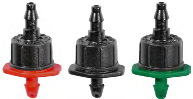
CETA® PC 1/2 gph Inlet 0.16" with 0.12" or 0.16" Outlet