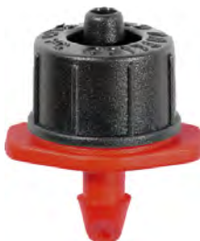
CETA® PC 1/2 gph Barb 0.16"