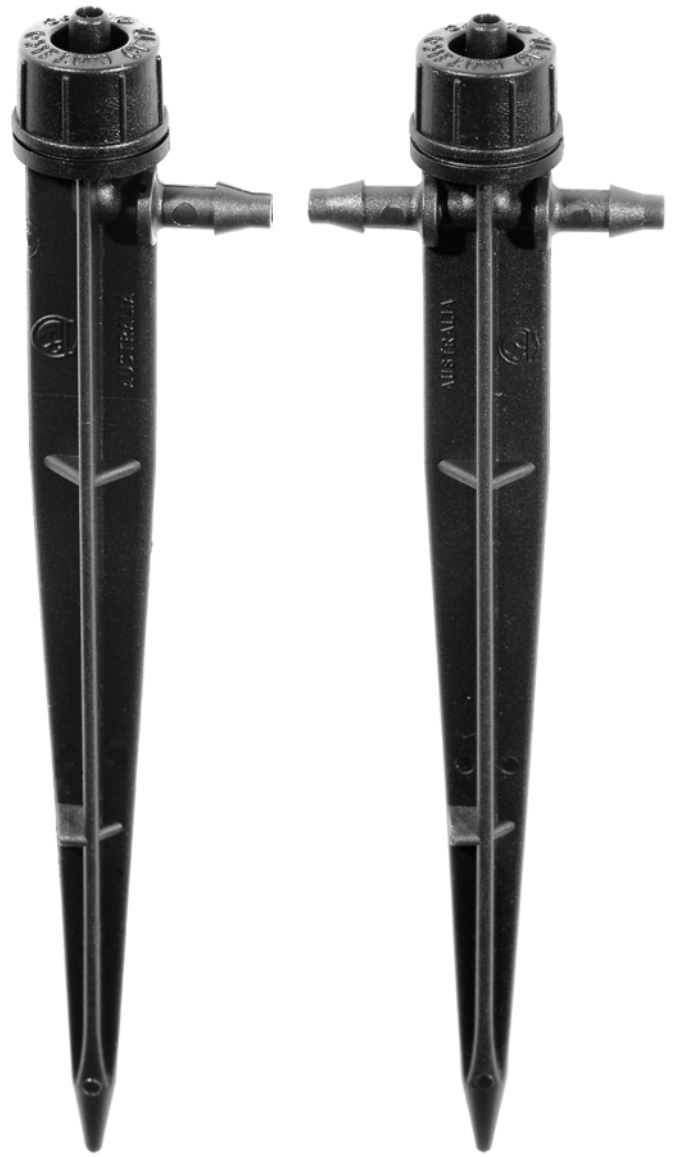
CETA® PC Spike with 0.16" Inlet

Pots, planter boxes, balcony patio and landscape applications.