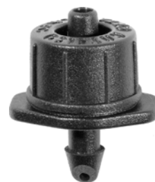
CETA® PC 1 gph Barb 0.16"