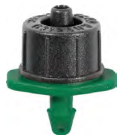
CETA® PC 2 gph Barb 0.16"