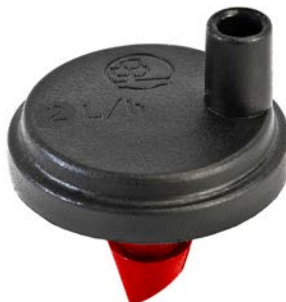
Agri Drip™ Classic 1/2 gph

This product has been independently tested by the Center for Irrigation Technology, California State University, Fresno.