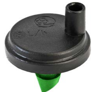
Agri Drip™ Classic 2 gph