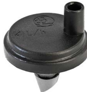
Agri Drip™ Classic 1 gph