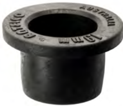
Capo® Rubber Grommet 19 mm