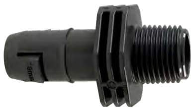
Xpando® Director 1/2" BSPM x 19 mm Take-Off

Simply drill a hole in the sprinkler lateral with the Xpando® Drill Bit, insert the Capo® Rubber Grommet, screw the Xpando Director® into the riser and then insert into the Capo® Rubber Grommet.