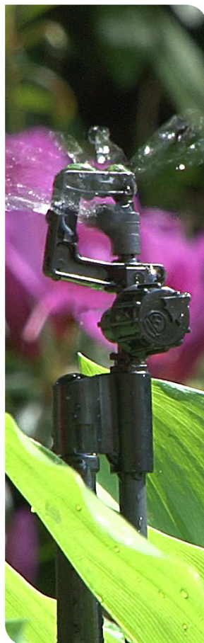
Vari-Rotor Spray™ Stake Assembly with 300 mm Tube and Self Piercing Adaptor