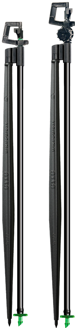
Rotor Spray™ Stake Assembly with 300 mm Tube and Self Piercing Adaptor