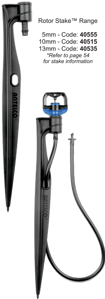
Rotor Stake™ Range