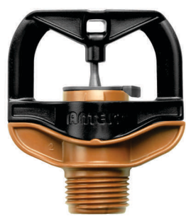
Rotor Rain® Plus PC with Deflector 3/8" Male Thread