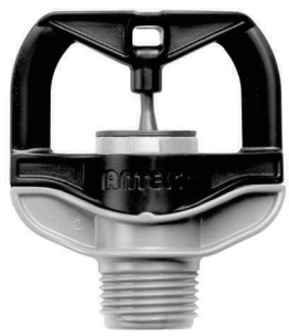
Rotor Rain® Plus PC 3/8" Male Thread