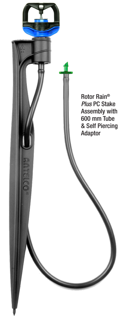
Rotor Rain® Plus PC Stake Assembly with 600 mm Tube & Self Piercing Adaptor