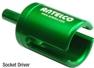
Socket Driver for Rotor Rain® Plus

* Refer to pages 42 & 43 for Sprinkler Accessories.