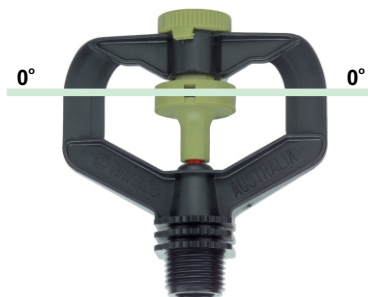
Upright - 0° Trajectory (Khaki Spinner)