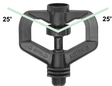
Upright - 25° Trajectory (Black Spinner)