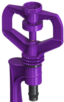
ReuZit® Sprinkler Assembly with Stake 13 mm Inlet