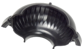
Rotor Max™ 180° Deflector