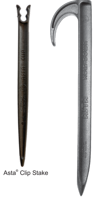
Asta® Hold-Down Stake