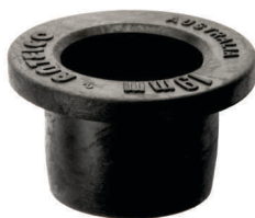
Capo® Rubber Grommet 19 mm