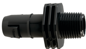
Xpando® Take-Off Director 1/2" BSPM x 19 mm