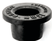
Capo® Rubber Grommet