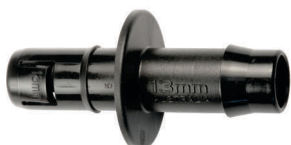
Xpando® Take-Off Adaptor