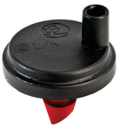
Agri Drip™ Classic 2 lph