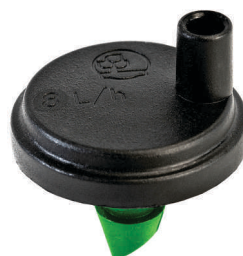
Agri Drip™ Classic 8 lph