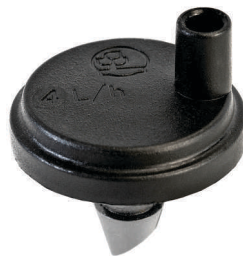
Agri Drip™ Classic 4 lph