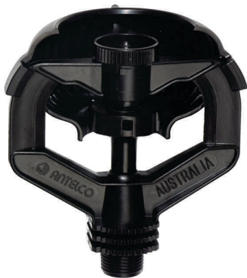
180° Deflector fitted

4. Ensure clips are fully engaged on both sides.