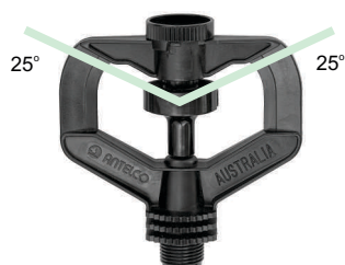
Upright - 25° Trajectory (Black Spinner)