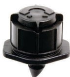
Mini Bubbler Barb 4 mm