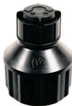
Mini Bubbler Thread 1/2" Female