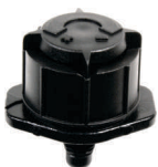
Mini Bubbler Thread 4 mm