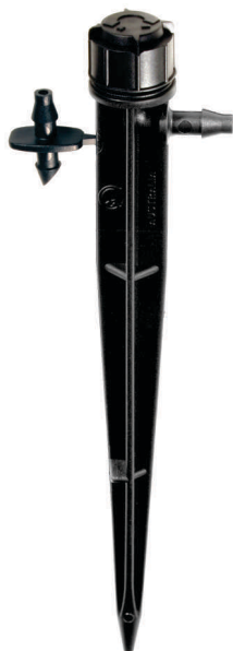
Mini Bubbler Spike Inlet 4 mm