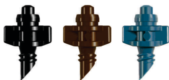
0.8 mm 0.9 mm 1.0 mm