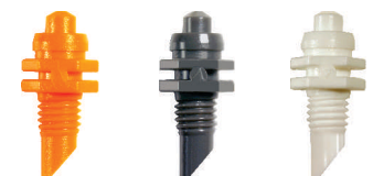
1.8 mm 2.0 mm 2.3 mm