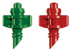
1.3 mm 1.5 mm