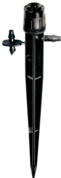
Spectrum™ Spike Inlet 4 mm