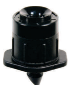
Spectrum™ Barb 4 mm