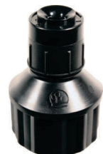
Spectrum™ Thread 1/2" Female