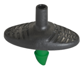
Pinch Drip™ PC 8 lph Barb 4 mm