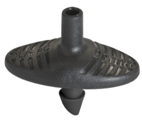
Pinch Drip™ PC 4 lph Barb 4 mm