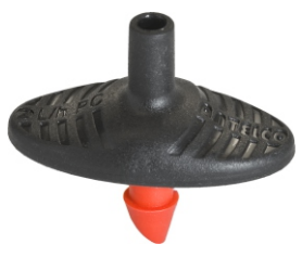
Pinch Drip™ PC 2 lph Barb 4 mm