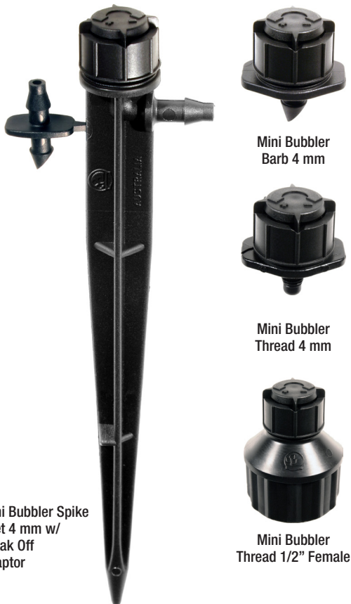
Mini Bubbler Spike Inlet 4 mm w/ Break Off Adaptor