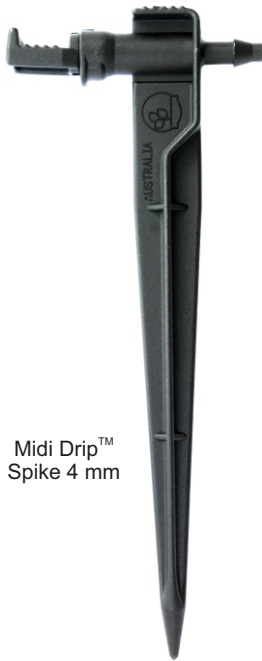
Midi Drip™ Spike 4 mm