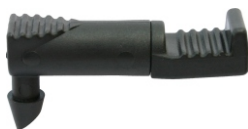
Midi Drip™ Barb 4 mm