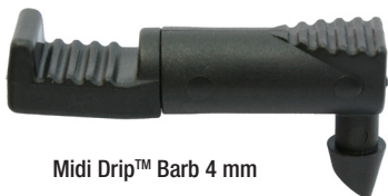
Midi Drip™ Barb 4 mm