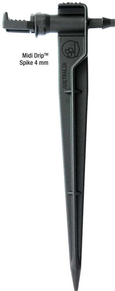
Midi Drip™ Spike 4 mm