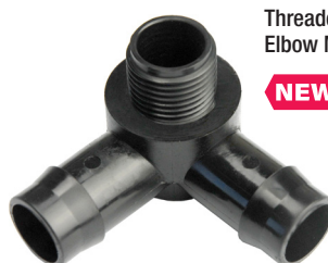
Threaded Corner Elbow Male