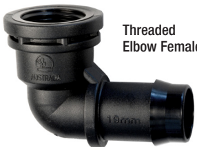
Threaded Elbow Female