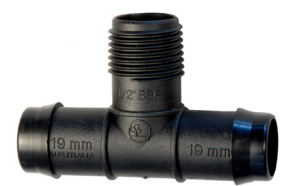
Threaded Tee Male