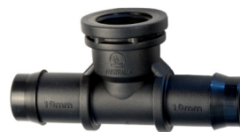
Threaded Tee Female