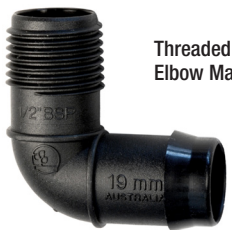
Threaded Elbow Male