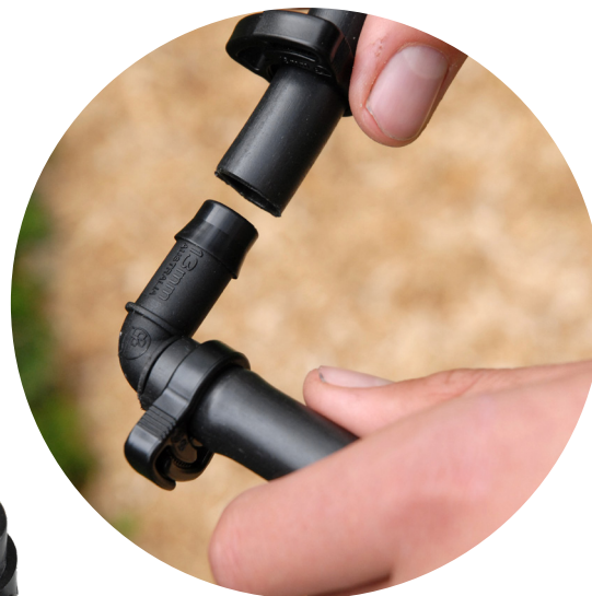
Threaded Corner Elbow Female