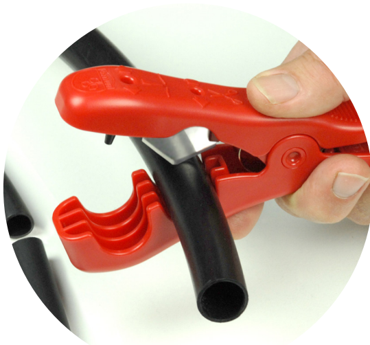
2 in 1 Punch & Cutter Retail Packaging