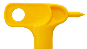
Key Punch ™