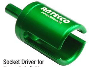
Socket Driver for Rotor Rain ® Plus