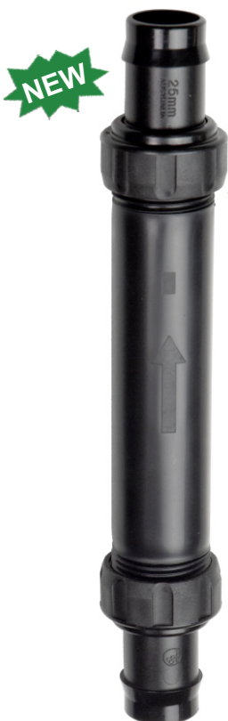
In-Line Filter 25 mm