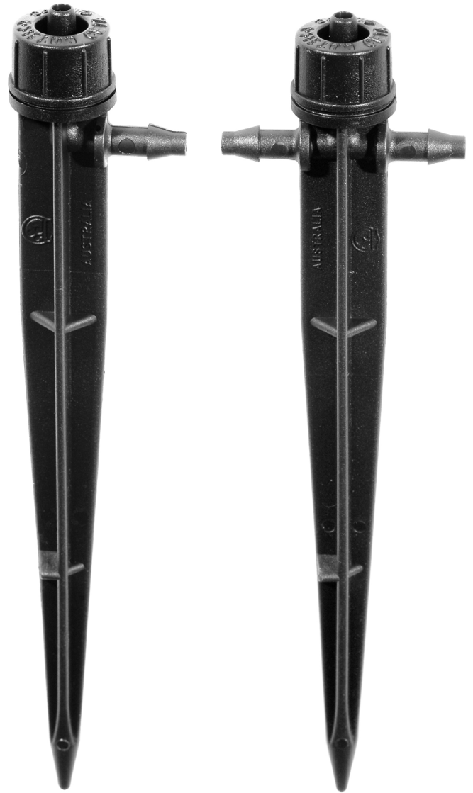
CETA® PC Spike Inlet/Outlet 4 mm