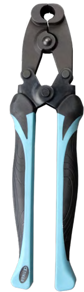
Compound Action Pincers

* Confirm tube specifications with the tubing manufacturer, as sizes may vary from those shown above.