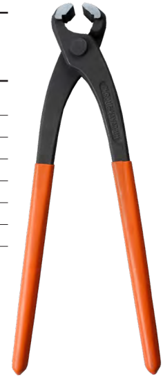
Dawn Industries Crimpers

* Retail ready packaging available in tear-off cartons for easy shelf display. * Confirm tube specifications with the tubing manufacturer, as sizes may vary from those shown above.