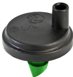
Agri Drip™ Classic 8 lph