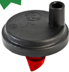
Agri Drip™ Classic 2 lph