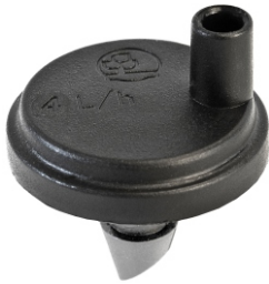
Agri Drip™ Classic 4 lph